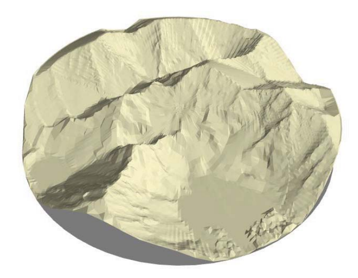
3D SURFACE MAP